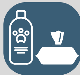
Skin shampoos, foams, wipes