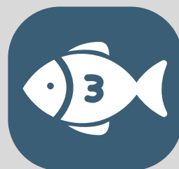
Essential Fatty Acids