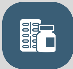
Itch blocking medications