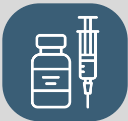
Allergen Specific Immunotherapy