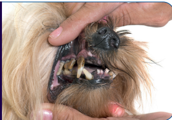
An example of a dog with more advanced periodontal disease.

In advanced cases, surgery may be needed to extract some teeth if the problem has caused more serious tooth decay.