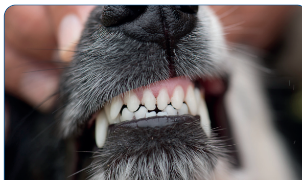
Healthy dogs teeth!

If your pet's teeth do require surgical intervention, such as a scale and polish or extractions, then it is important to keep the teeth and gums healthy afterwards to prevent the need for further surgery again in the future.