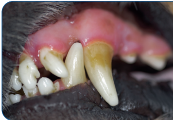
An example of early stage gum disease in a dog caused by plaque build up

Plaque builds up and creates tartar which in the early stages will lead to inflammation around the gum line (gingivitis)